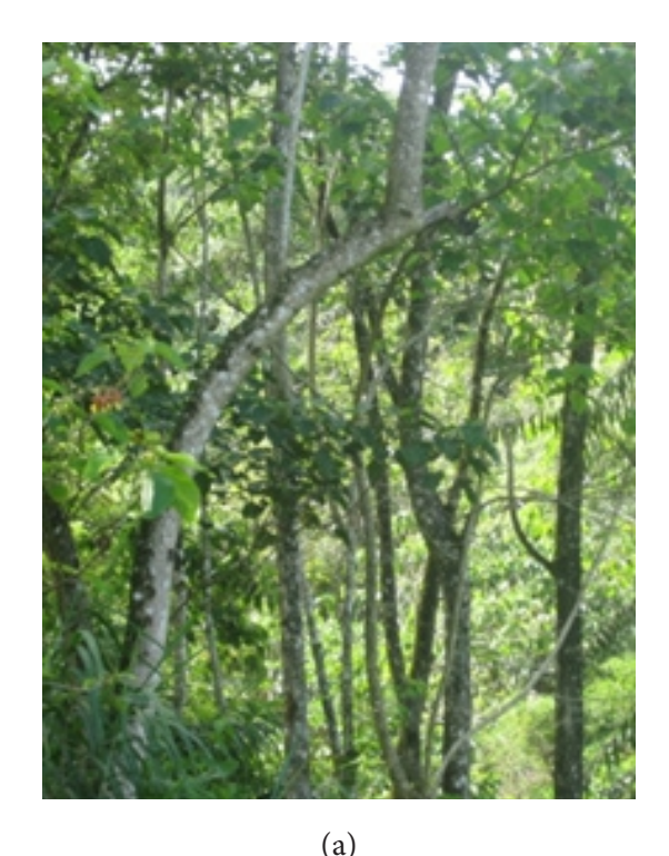
Figure 2. Photographs showing: (a) severe sweep and (b) severe crook with log length only around 1 m long

Those who said they remove the trees with bad form were further asked to choose which tree with certain defect is likely to be removed first (Figure 3). The tree with abrupt bend in trunk came out to be the first choice followed by the tree that is too branchy. Both of them contain short logs.