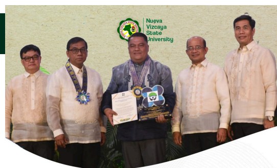
Nueva Vizcaya State University BEST R&D PAPER AWARD 1 st Place Research Category Development of Formulated Entomopathogenic Fungi (EPF) as Biofungicide Against Tomato Black Leaf Mold (TBLM)