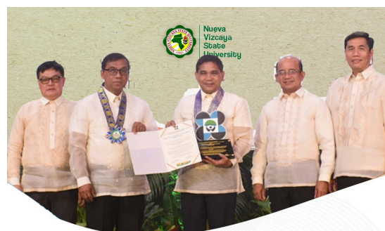
Nueva Vizcaya State University BEST R&D PAPER AWARD 1 st Place Development Category Tissue Culture and Macro-Propagation of Saba: Cagayan Valley's Planting Material Support System for Banana

#weENGAGE #weINNOVATE #weEMPOWER www.nvsu.edu.ph